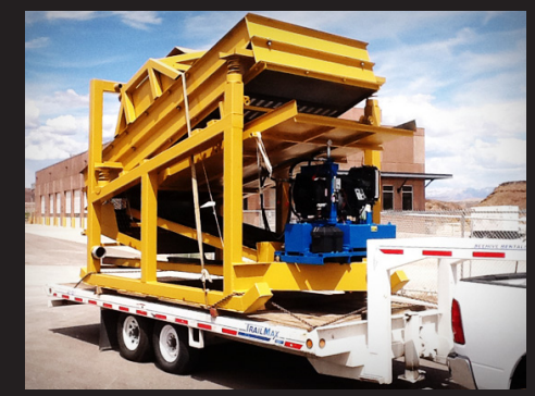
200 ton per hour machine behind a standard pickup truck.

Efficient power means more money in your pocket. All machines use Premium Rexnord bearings on the shaker system that come equipped with grease points that will assist with years of use. Each machine is highly portable and most can be mounted on trailers for even more portability.